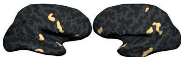
Figure 2. Between-subjects surface-based average showing greater response for song versus speech stimuli.

The intersubject surface-based average song versus speech subtraction is shown in Figure 2. In both hemispheres, there was increased response associated with song perception along the anterior temporal plane considerably anterior to Heschl's gyrus and on a small patch of cortex on the MTG. In addition, there was extensive response on the left SMG, the right posterior superior temporal gyrus (STG), and the left IFG. Finally, there was significant response on the inferior PCG in the right hemisphere but only a small equivalent on the left. (Talairach coordinates of the areas showing greater response in the song condition, as compared with the speech condition, are listed in Supplementary Table S4.) No areas were found to be significantly more activated by the speech stimuli than by the song stimuli.