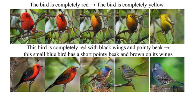
Figure 8. (Left to right) Images generated by interpolating two sentence embeddings. Gradual appearance changes from the first sentence's meaning to that of the second sentence can be observed. The noise vector z is fixed to be zeros for each row.

Conditioning Augmentation. We also investigate the efficacy of the proposed Conditioning Augmentation (CA). By removing it from StackGAN 256 \times 256 (denoted as "no CA" in Table 2), the inception score decreases from 3.70 to 3.31. Figure 7 also shows that 256 \times 256 Stage-I GAN (and StackGAN) with CA can generate birds with different poses