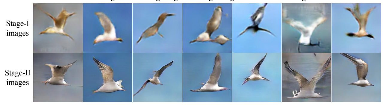
This smaller brown bird has white stripes on the coverts, wingbars and secondaries