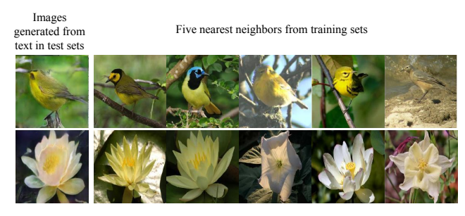
Figure 6. For generated images (column 1), retrieving their nearest training images (columns 2-6) by utilizing Stage-II discriminator D to extract visual features. The L2 distances between features are calculated for nearest-neighbor retrieval.

tion constraints, GAWWN [24] obtains a better inception score on CUB dataset, which is still slightly lower than ours. It generates higher resolution images with more details than GAN-INT-CLS, as shown in Figure 3. However, as mentioned by its authors, GAWWN fails to generate any plausible images when it is only conditioned on text descriptions [24]. In comparison, our StackGAN can generate 256 \times 256 photo-realistic images from only text descriptions.