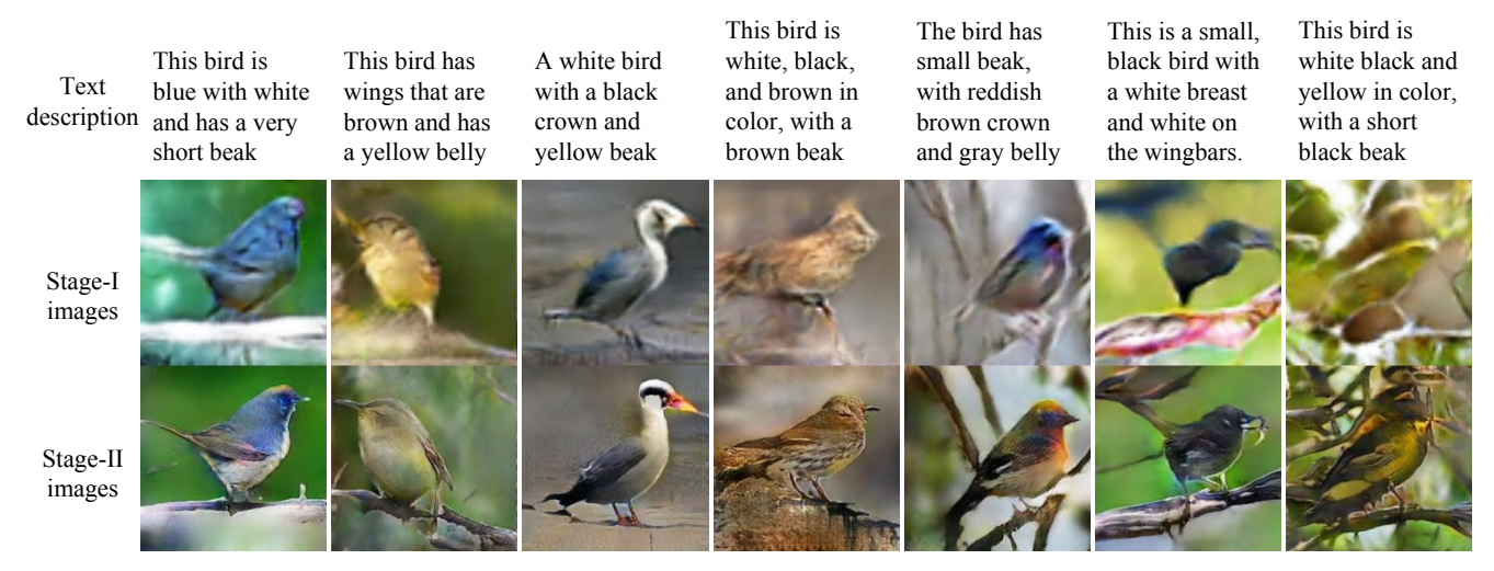
Figure 5. Samples generated by our StackGAN from unseen texts in CUB test set. Each column lists the text description, images generated from the text by Stage-I and Stage-II of StackGAN.