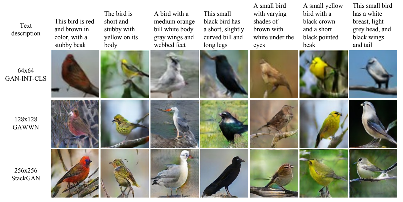
Figure 3. Example results by our StackGAN, GAWWN [24], and GAN-INT-CLS [26] conditioned on text descriptions from CUB test set.