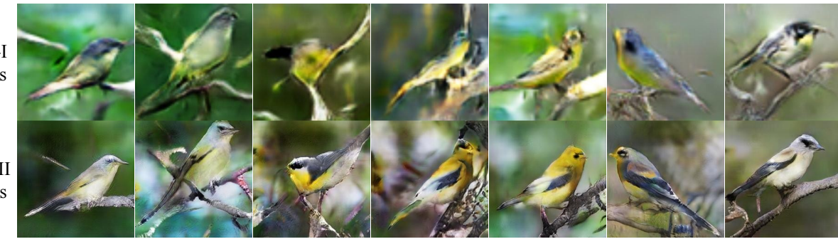
This bird has wings that are black and has a white belly