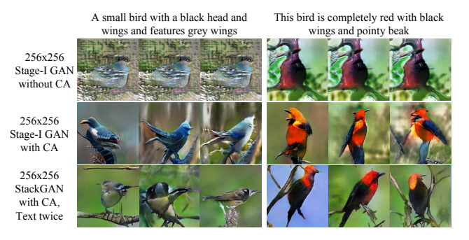
Figure 7. Conditioning Augmentation (CA) helps stabilize the training of conditional GAN and improves the diversity of the generated samples. (Row 1) without CA, Stage-I GAN fails to generate plausible 256 \times 256 samples. Although different noise vector z is used for each column, the generated samples collapse to be the same for each input text description. (Row 2-3) with CA but fixing the noise vectors z, methods are still able to generate birds with different poses and viewpoints.