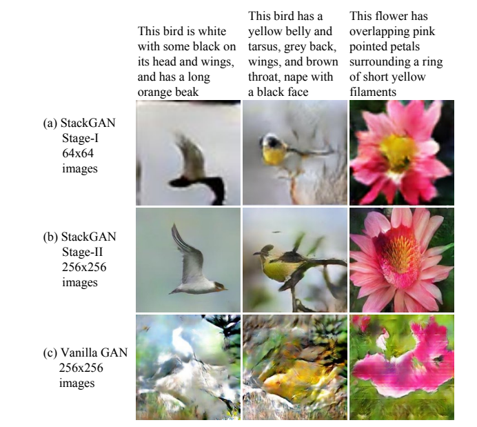
Figure 1. Comparison of the proposed StackGAN and a vanilla one-stage GAN for generating 256 \times 256 images. (a) Given text descriptions, Stage-I of StackGAN sketches rough shapes and basic colors of objects, yielding low-resolution images. (b) Stage-II of StackGAN takes Stage-I results and text descriptions as inputs, and generates high-resolution images with photo-realistic details. (c) Results by a vanilla 256 \times 256 GAN which simply adds more upsampling layers to state-of-the-art GAN-INT-CLS [26]. It is unable to generate any plausible images of 256 \times 256 resolution.

GANs [26, 24] are able to generate images that are highly related to the text meanings.