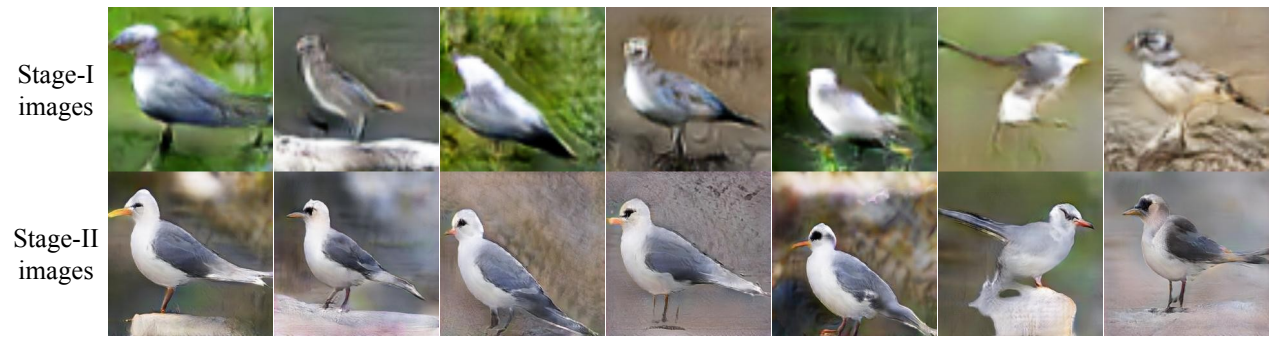
A large bird has large thighs and large wings that have white wingbars

This bird sits close to the ground with his short yellow tarsus and feet; his bill is long and is also yellow and his color is mostly white with a black crown and primary feathers